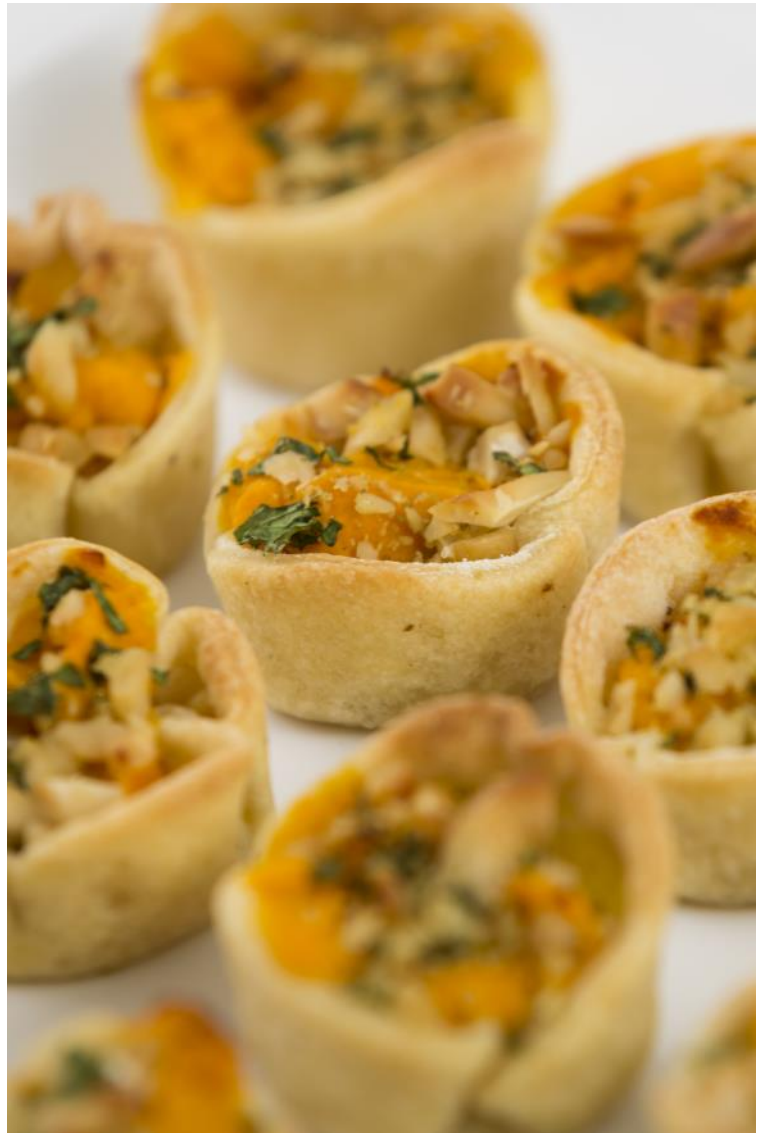
Platters serve 15-20 guests

Kabana, Cheese and Onions Fresh Vegetables Dips and Biscuits